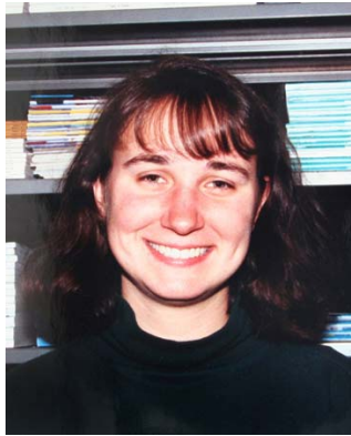
Denise Kmetzo Environmental Consulting