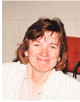
Honoree Fleming Faculty