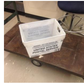
Mail Bin & Cart