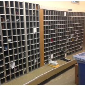
Mail Pigeon Holes