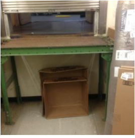
Mail Reception Area