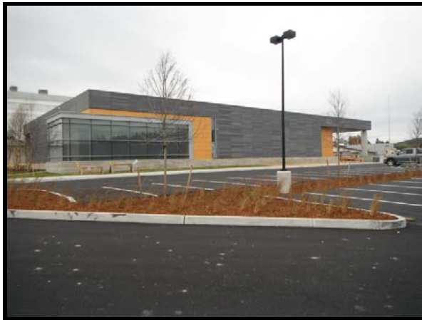
Exterior view of the new Squash Center

The design of the Squash Center started in 2011 following a year-long master planning exercise in which locations for the new Squash Center and the new Virtue Field House (constructed 2013-2015) were identified. Once set, a geotechnical program identified very soft compressible clay materials at the designated squash site. To accommodate the strict tolerances of the squash courts, the potential for differential foundation settlement had to be reduced and managed. In the fall of 2012, site work started with excavation and the installation of wick drains and a pre-load to accelerate and manage post-construction foundation settlement. Following the four month pre-load and monitoring period, site construction started in March 2013, and the building was completed for use in October 2013. A green roof was added to the building in the summer of 2014.