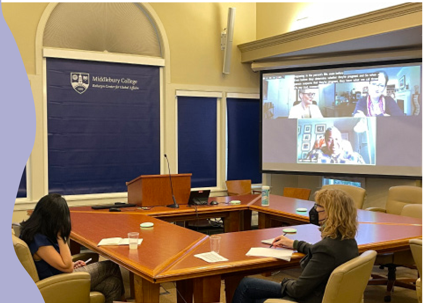
The screening of the event in the Robert A. Jones Conference Room