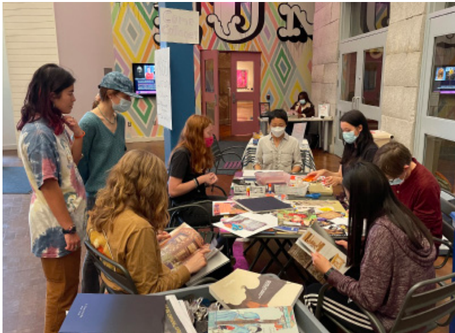
The event in the Mahaney Art Center