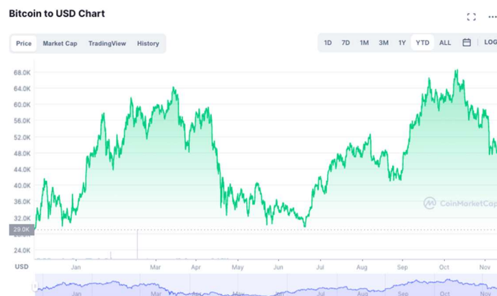
Graph 1 4

Even if traditional financial institutions have decided to avoid dealing in emerging industries such as crypto directly, they may still be vulnerable to its risks if they fail to develop adequate systems to monitor their exposure. Chainanalysis' 2021 Crypto Crime Report found that,