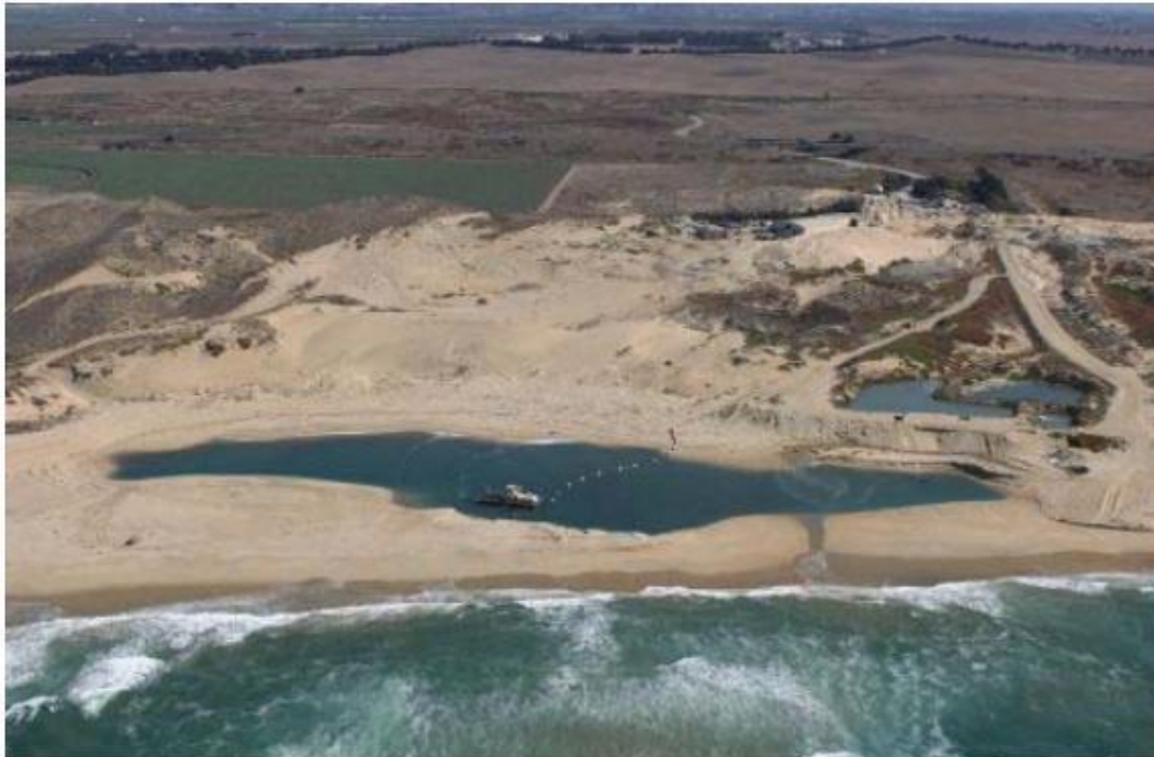
Figure 2: The Lapis mine site and dredge pond. Note how waves from the bay (foreground) wash over the beach (right side of photo), depositing water and sand into the Lapis mine pond.

Since shoreline dredging at Lapis ceased in 1959, the mine has been using a suction dredging process to extract sand from a man-made pond located between the shoreline and dunes (Hart, 1966) (See Figure 2). This mining process acts as a sand sink, drawing in sand during annual storm events and high tides. This results in less sand available in the southern Monterey Bay littoral cell sand budget 1 and significantly impacts the erosion rate (PWA, 2008). The southern Monterey Bay littoral cell is bound by the Salinas River to the north and Municipal Wharf II in Monterey to the south and comprises the geographical scope of this study. Waves refracting over the submarine canyon offshore from the Salinas River delta cause the mean alongshore sediment transport south of the Salinas River to be directed South, and the mean alongshore sediment transport north of the Salinas River to be directed North (Thornton et al, 2006).