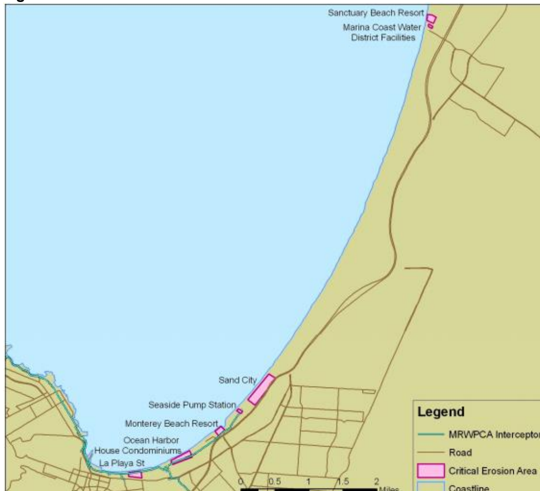
Figure 3: Locations of critical areas of erosion