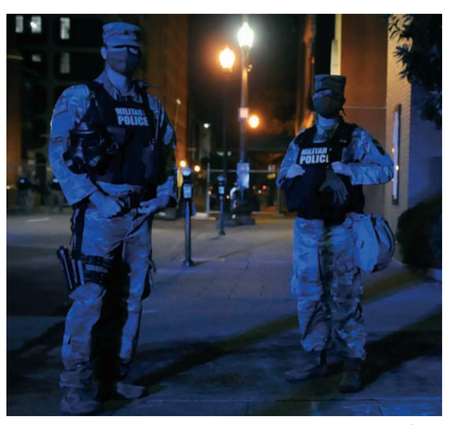
The police need to be as aware of left wing extremists as they are of the right

"When it comes to right wing groups, there is some potential there, but it's probably insignificant. Historically there have been a number of examples of very right-wing eco-