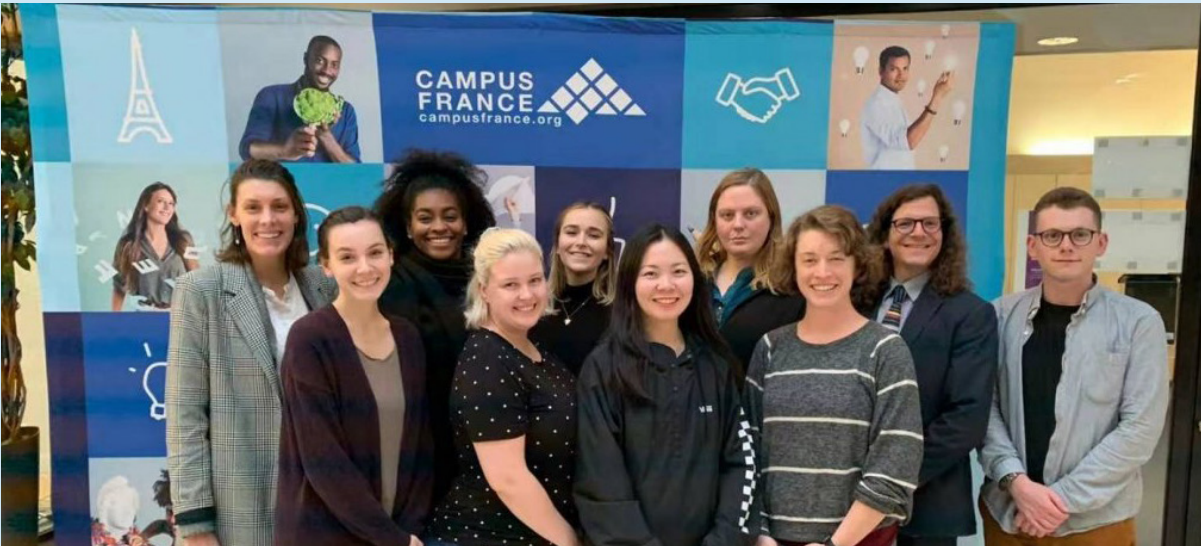
Students participated in an international education practicum in France in January 2020. This photo shows the group visiting Campus France, a nonprofit educational organization.