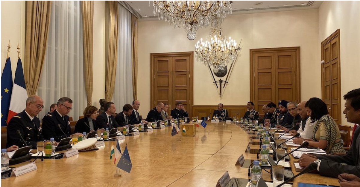
Gahlot also interpreted during meetings between the Indian Defense Minister and French Defense Minister Florence Parly during the second edition of the “India-France Annual Defence Dialogue.”