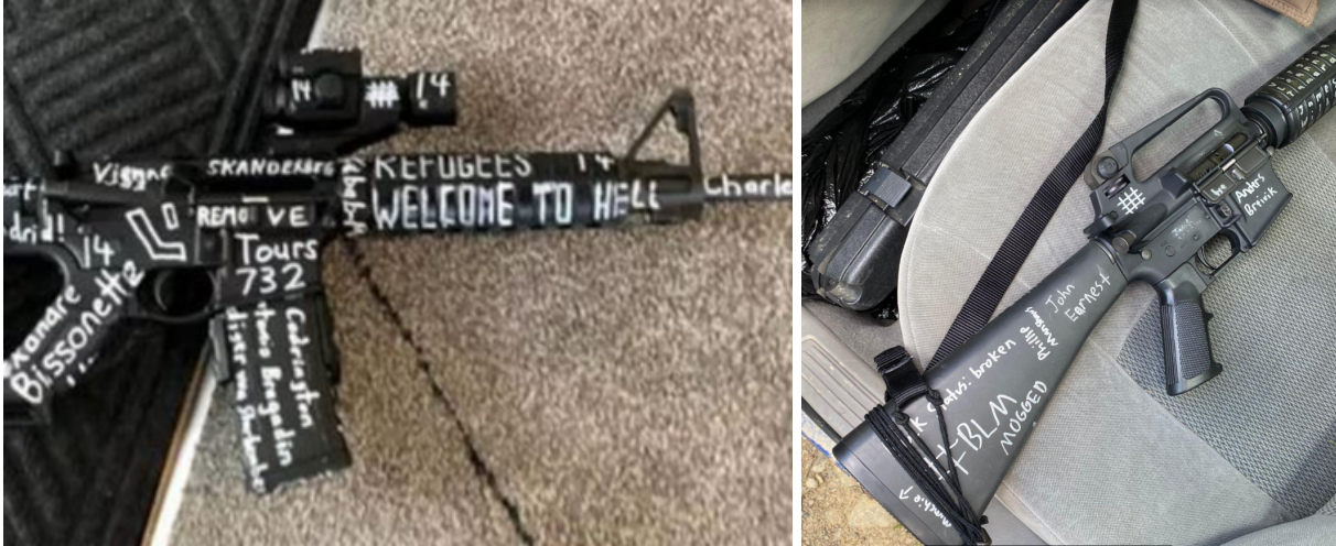
Brenton Tarrant's weapon featured on the left; The weapon Payton Gendron used featured on the right