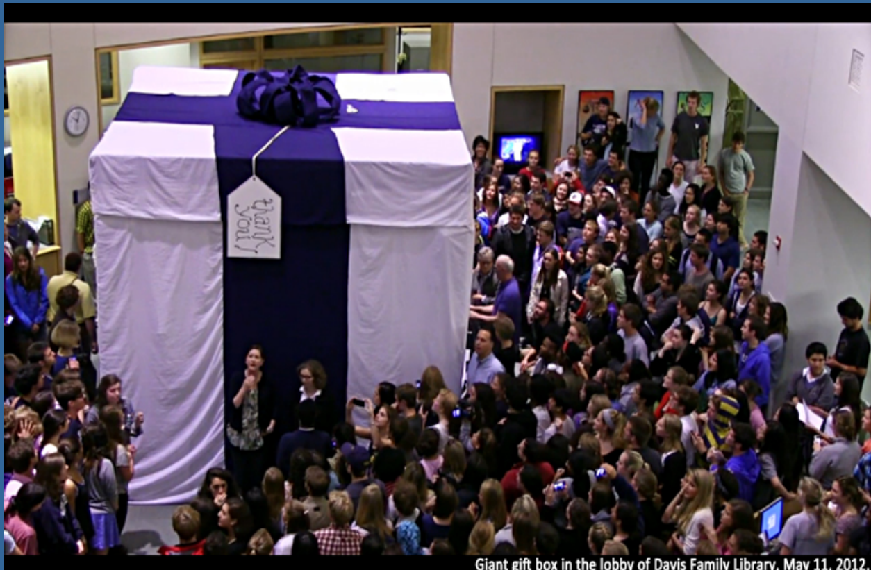
Giant gift box in the lobby of Davis Family Library, May 11, 2012.