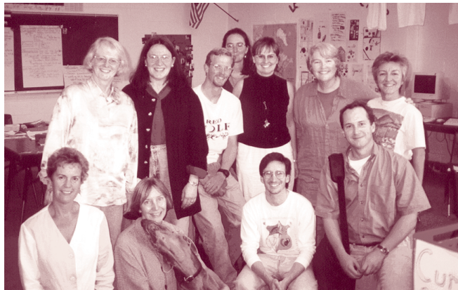
Vermont Bread Loafers at a weekend meeting at Camels Hump Middle School

for example, and say, "You ought to talk to that person. What a fine teacher!" Gradually, I realized that these informal conversations with teachers would have an enormous impact on my own teaching. And those first conversations during the summer evolved because we had BreadNet to help us stay connected during the school year. I still treasure the notes I printed out from those early BreadNet pioneers, and just as precious are the conversations still evolving as this communications technology matures. With this technology, our conversa-