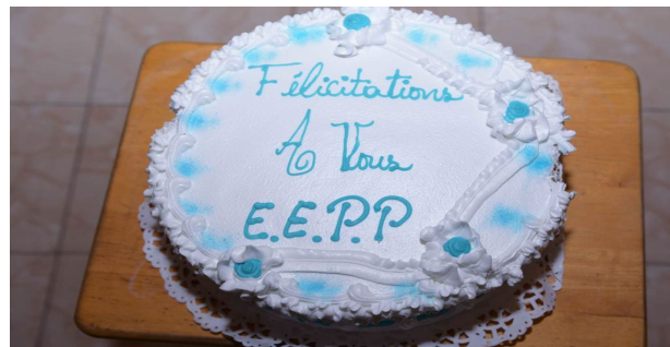
EEPP Peace cake Celebrations!

The last day of the training creates too much energy so we come to understand how PEACE is important to the world because of happiness and quality moments.