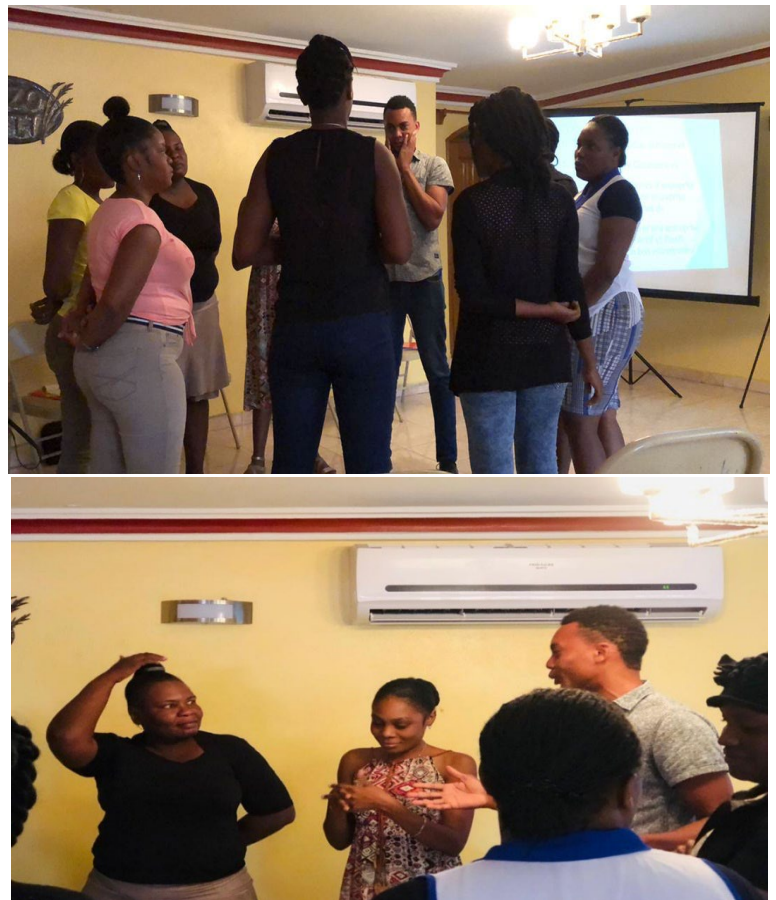
Economic Empowerment Project for Peace-2021

In a large scale according to be successful in business, we have heard since years that we have to act Big, do big and at last Think big which is good to train our brain to succeed but one thing is important so we don't have to ignore and it's about the ones whom can act big let alone think big and this is the reason this training was crucial because it has been done in a small scale, the very basic part of commerce to understand the concepts and how to manage them for our benefit and for the communities too. Moreover, to identify type of enterprises at a lower level and their role in our communities, The trainer asked to the women to share to each other's their qualities and a good businesswoman or entrepreneurs' ones because they will be alone on the marketplace to sell their products, so they must know themselves so do their customers.