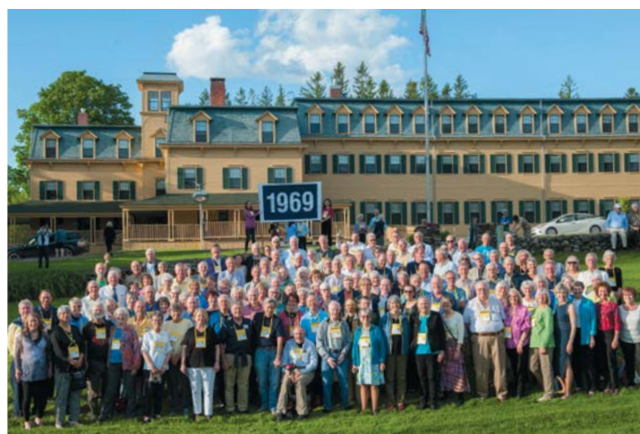
The Class of 1969 at their 50th Reunion