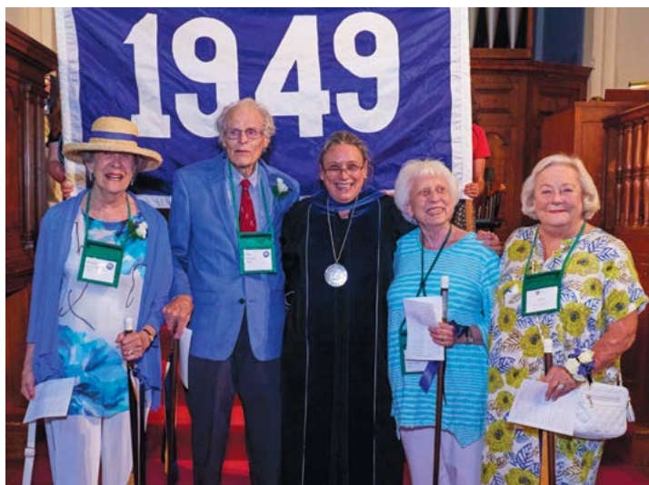
The Class of 1949 at their 70th Reunion