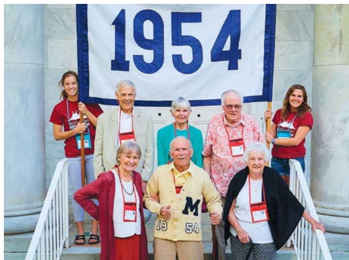
The Class of 1954 at their 65th Reunion