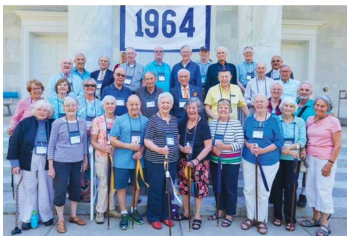
The Class of 1964 at their 55th Reunion