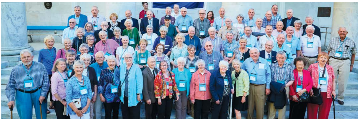
The Class of 1959 at their 60th Reunion