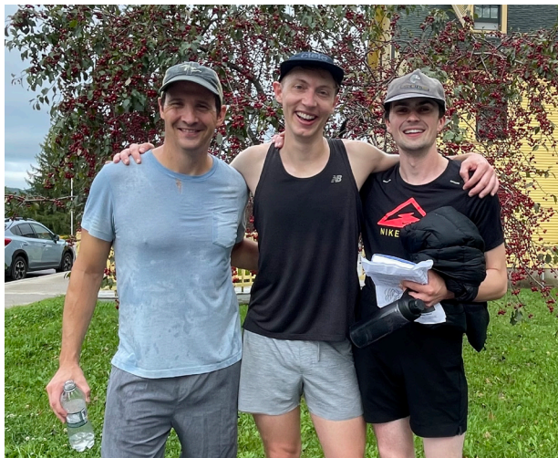
The winners bask in glory.