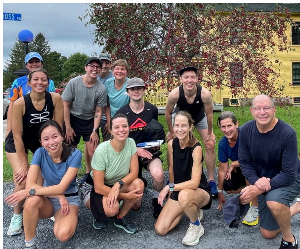
Off to the races!